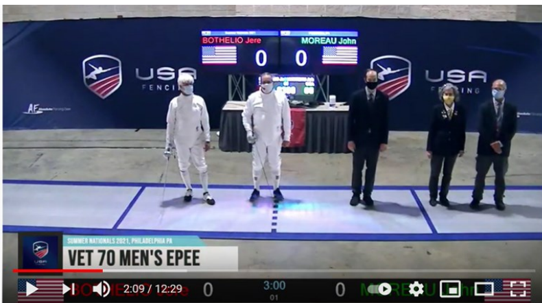
Vet 70 Men's Epee - Summer Nationals - Philadelphia, PA

CFC REQUIREMENTS RE: FACIAL COVERINGS (mask under the fencing mask): Must comply with safety regulations described in USA Fencing’s “Return to Fencing Protocol” at all times. The mask must cover the nose and mouth. Per USA Fencing, “Face coverings must be two-layer cloth masks or surgical face coverings. Single-layer gaiters, bandannas, masks with vents and inserts that clip into the fencing mask and do not fully contact the athlete’s face are not permitted. ” Fencers participating should NOT wear N95 or KN95 masks. Spectators who are not fencing may wear N95 or KN95 masks.