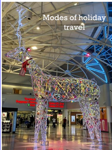
Modes of holiday travel

Referee briefings illuminate the nuances of fencing rules and calls, valuable not just for refereeing but to teach the sport to recreational & future competitors. The US has gained international prominence.