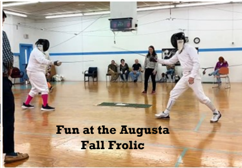
Fun at the Augusta Fall Frolic