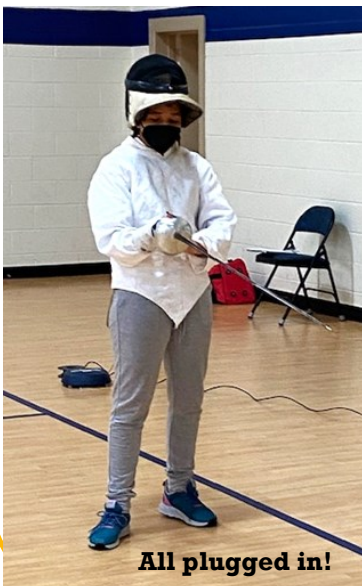
All plugged in!

if you forget and leave without signing in, there is a "penalty"— You are required to bring a homemade treat, e.g., Cookies or Brownies to your clubmates at your next meeting. We have discovered talented bakers in our Club! Please be sure the treats are individually wrapped for take-home, complying with gymnasium rules! Thank you!!