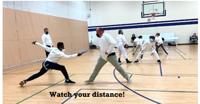
Watch your distance!

know are more cautious than some groups and institutions. Unlike students in classrooms, colleagues in offices, and friends having lunch, our sport involves athletic exertion directly facing training partners, and our members range in ages and underlying conditions*. We support everyone's health and participation in our fantastic sport. It's no surprise that fencers often refer to our sport community as our Fencing Family. While vaccinations do not "prevent" someone from getting COVID-19, we know that (1) vaccinated communities have lower infection rates and less severe cases than unvaccinated communities, and (2) the risk of immediate and longterm harm to children and adults from actually getting COVID-19 is higher than the risk of harm from the vaccine. (Sources available. Questions welcome.) Our policies are data-based from scientific studies. Thank you for your ongoing cooperation. We will do our best to minimize your risk of COVID-19 exposure in our fencing community. (If you are not feeling well, please stay home that night.)