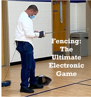
Fencing: The Ultimate Electronic Game