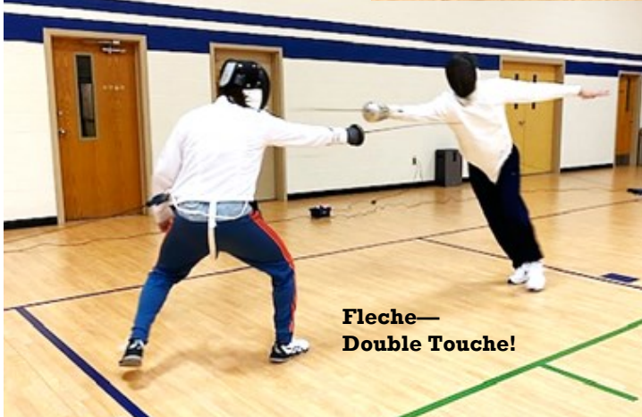
Fleche— Double Touche!