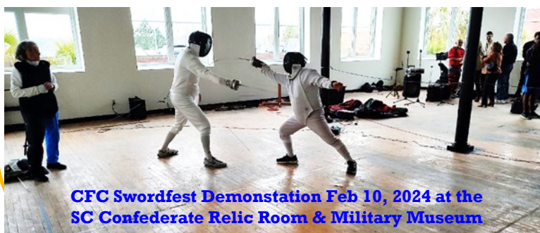
CFC Swordfest Demonstration Feb 10, 2024 at the SC Confederate Relic Room & Military Museum