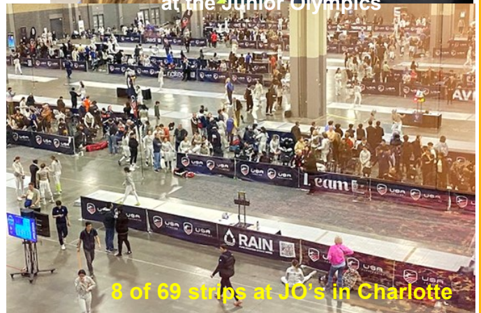
8 of 69 strips at JO's in Charlotte

" Access " level membership in USA Fencing permits you to register for sanctioned local tournaments (those on askfred.net) including National Qualifiers. " Competitive " level membership is required to register for National and Regional events. You may upgrade your membership anytime throughout the year if required.