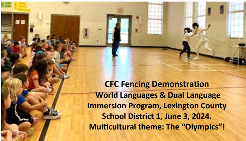
CFC Fencing Demonstration World Languages & Dual Language Immersion Program, Lexington County School District 1, June 3, 2024. Multicultural theme: The "Olympics"!