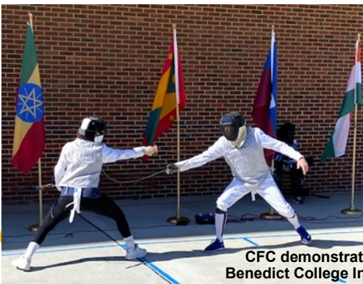
CFC demonstrates Fencing at Benedict College International Day

SIGN-IN sheet & "Penalty" Policy: CFC still requires all fencers and guests to sign the Sign-In sheet in the fencing area each evening you attend. Club members know our longstanding rule and tradition that if you forget and leave without signing in, there is a "penalty"— You are required to bring a homemade treat, e.g., Cookies or Brownies to your clubmates at your next meeting. We have discovered talented bakers in our Club! Please be sure the treats are individually wrapped for take-home, complying with gymnasium rules! Thank you!!